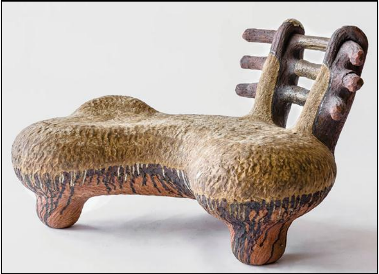
FIGURE B: uBuhlanti (Kraal) bench by Andile Dyalvane (South Africa), 2020.

Analyse the use of the following terms in relation to their use in FIGURE B above: