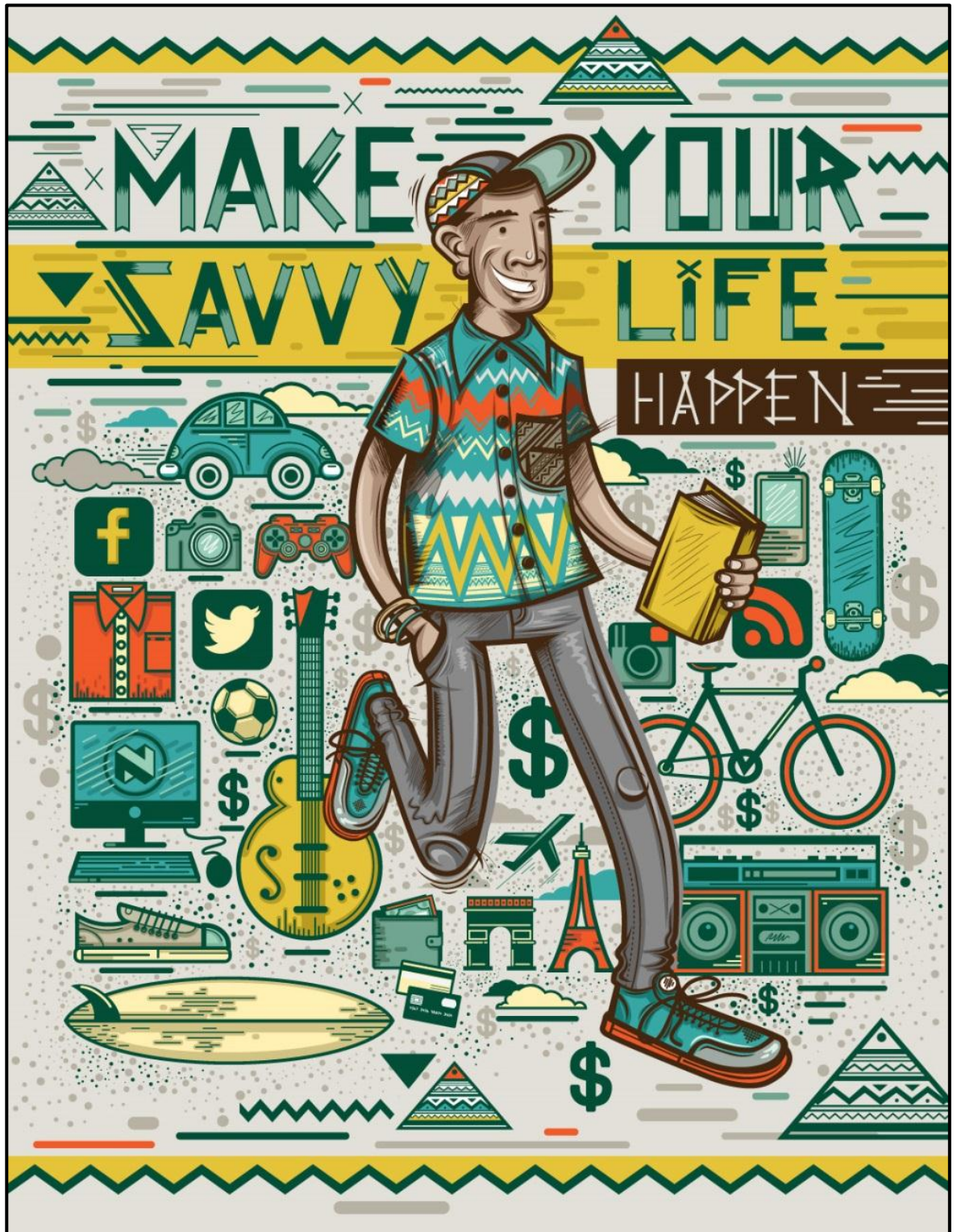
FIGURE C: Make Your Savvy (a wise, practical person) Life Happen poster by Wesley van Eeden (South Africa), 2020.

Identify and discuss TWO symbols used in FIGURE C above and explain their possible meanings in relation to the message of the poster.