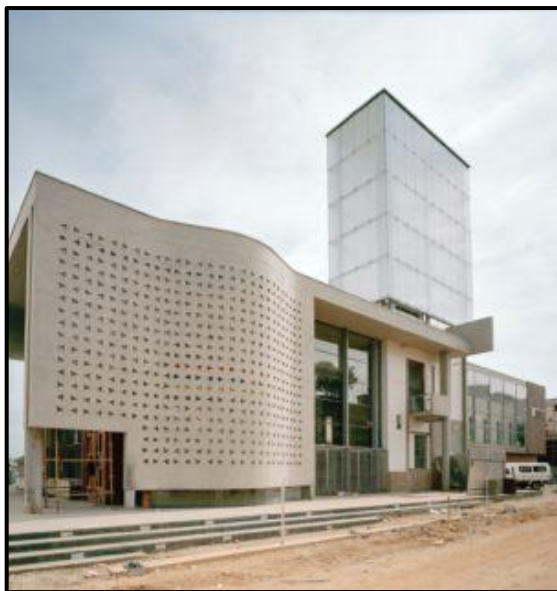
FIGURE G: The Constitutional Court by Urban Solutions and OMM Design Workshop (South Africa), 1996.