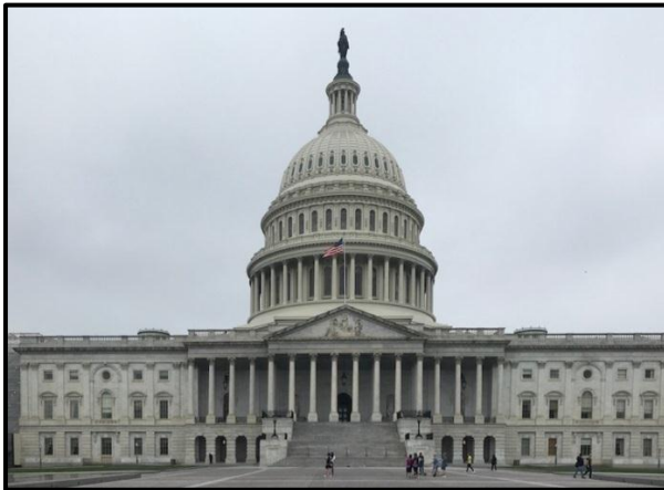
FIGURE F: The United States Capitol by William Thornton (USA), 1793–1826.