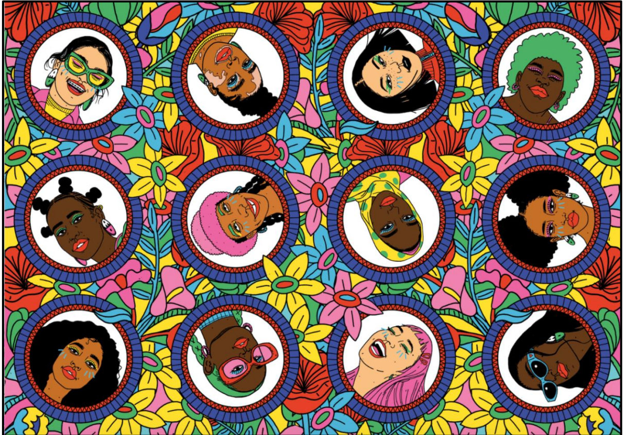
FIGURE A: Surface design by Zinhle Sithebe (South Africa), 2020.

1.1.1 Analyse the use of the following elements and principles in FIGURE A above: