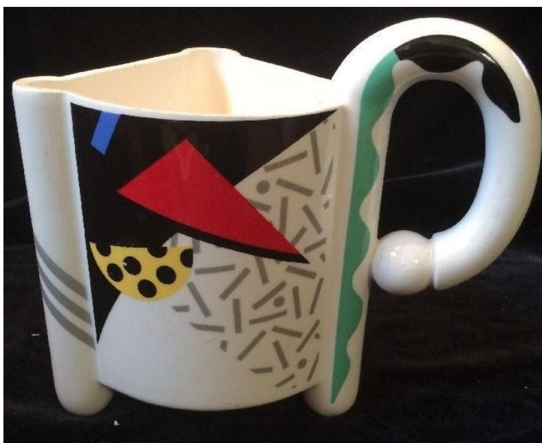
FIGURE E: Carnival mug by Fujimori for Kato Kogei Ceramics (Japan), 1980s.

Write a paragraph in which you compare the mug in FIGURE D with the mug in FIGURE E.