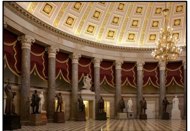
Detail of the United States Capitol interior.