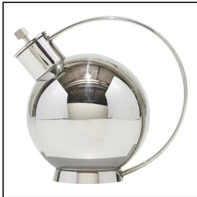
FIGURE I: Bauhaus cocktail shaker by Marianne Brandt (Germany), 1925.

Write an essay (at least ONE page) in which you compare the TWO jugs above and explain how they are typical of the design movements they represent.