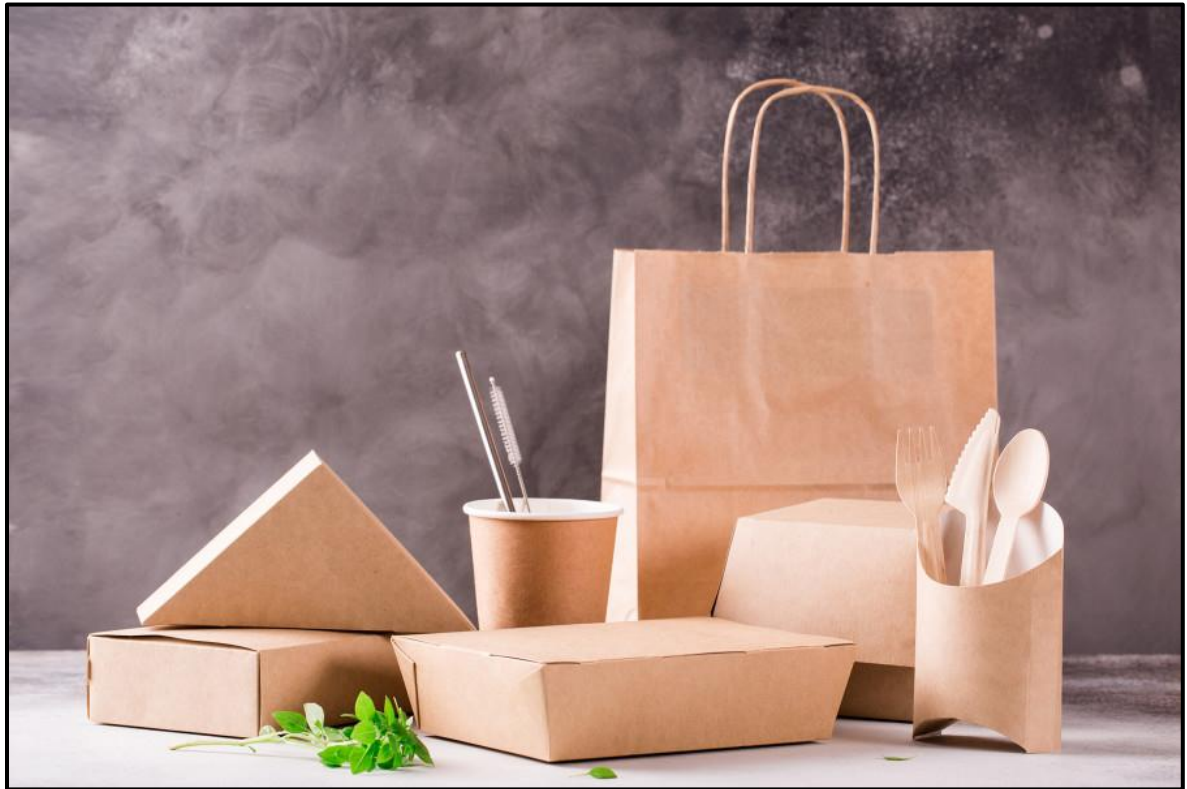
FIGURE K: Eco-friendly packaging by Viro Solutions (South Africa), 2019.

6.1.1 Discuss why the packaging in FIGURE K is eco-friendly. (2)