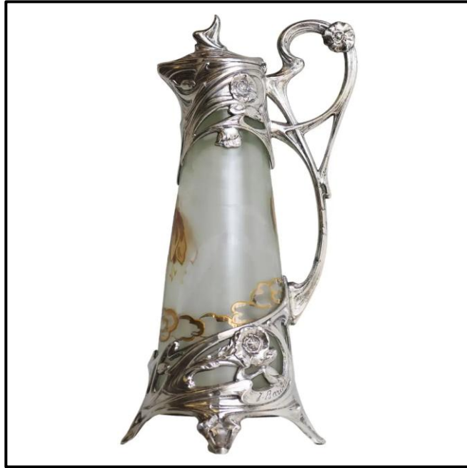
FIGURE H: Art Nouveau decanter by J Barian (France), 1900s.