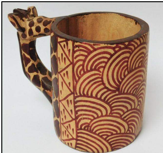
FIGURE D: Wooden Giraffe mug , designer unknown (Kenya), 2015.