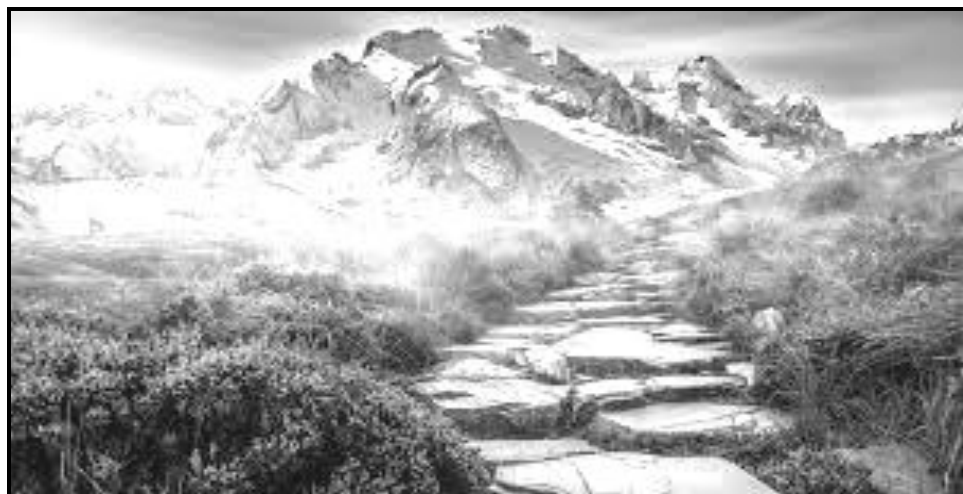
[Lo mfanekiso uthathwe kwi- www.google.co.za ]