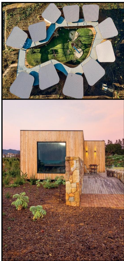
FIGURE 8b: The top image indicates the aerial view of the school. The bottom image shows the large windows that ensure that the school gardens are visible from all the classrooms and other buildings.