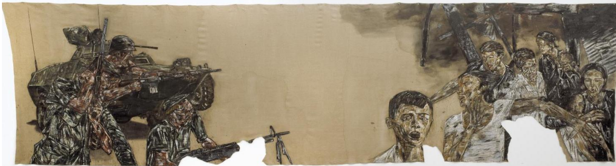
FIGURE 3b: Leon Golub, Vietnam II , acrylic on canvas, 1973.