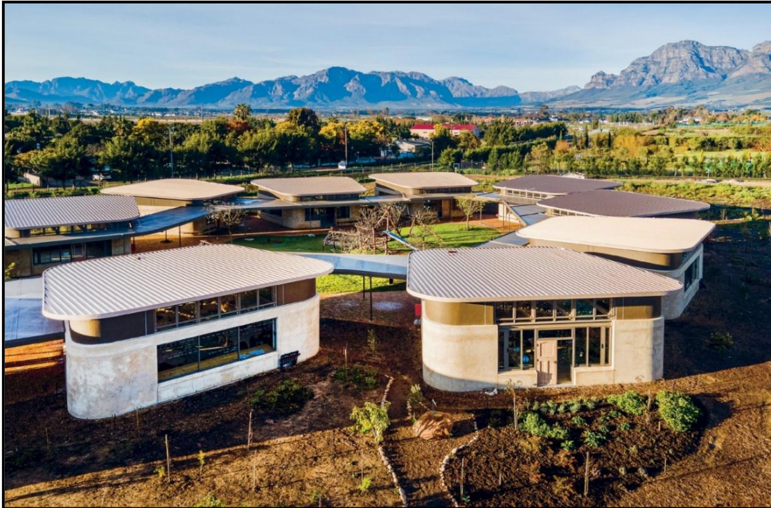
FIGURE 8a: Fabio Venturi (Terramanzi Group), Green School South Africa (GSSA) , Paarl (Western Cape), concrete and recycled materials, 2022.