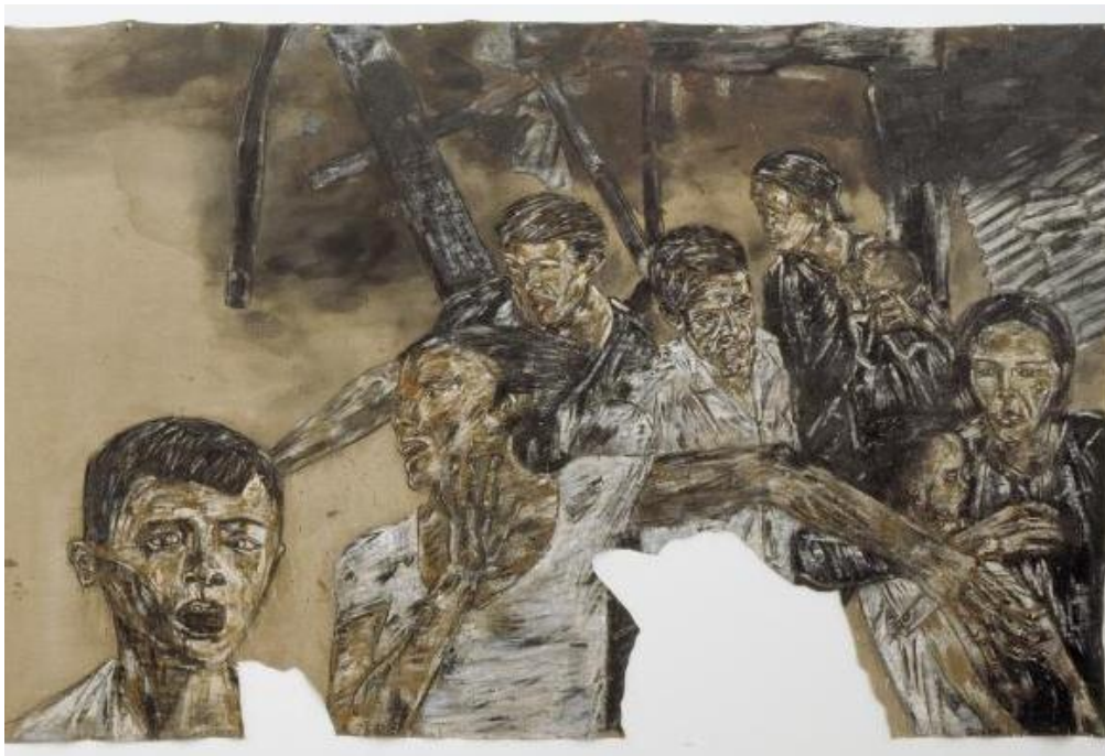
FIGURE 3c: Leon Golub, Vietnam II (detail), acrylic on canvas, 1973.