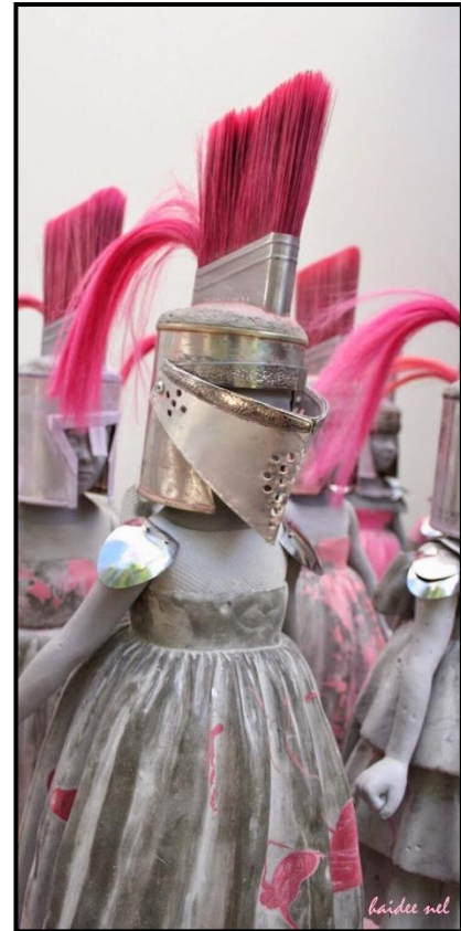
FIGURES 7a and 7b (detail): Haidee Nel, Infantry Children/Kaalvoetsoldate (Barefoot Soldiers) , sculptural installation, mixed media (cement, plastic, metal, brushes and marble), 2015.