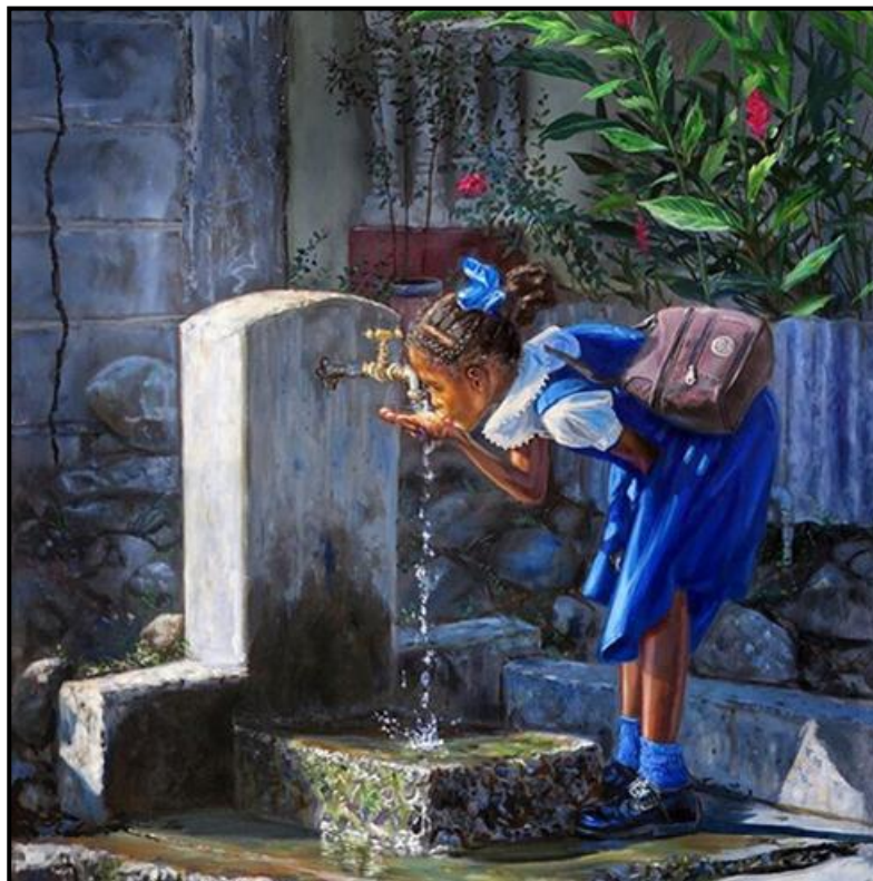
FIGURE 1b: Jonathan Guy-Gladding, Stand Pipe #3 , oil on canvas, c. 2019.