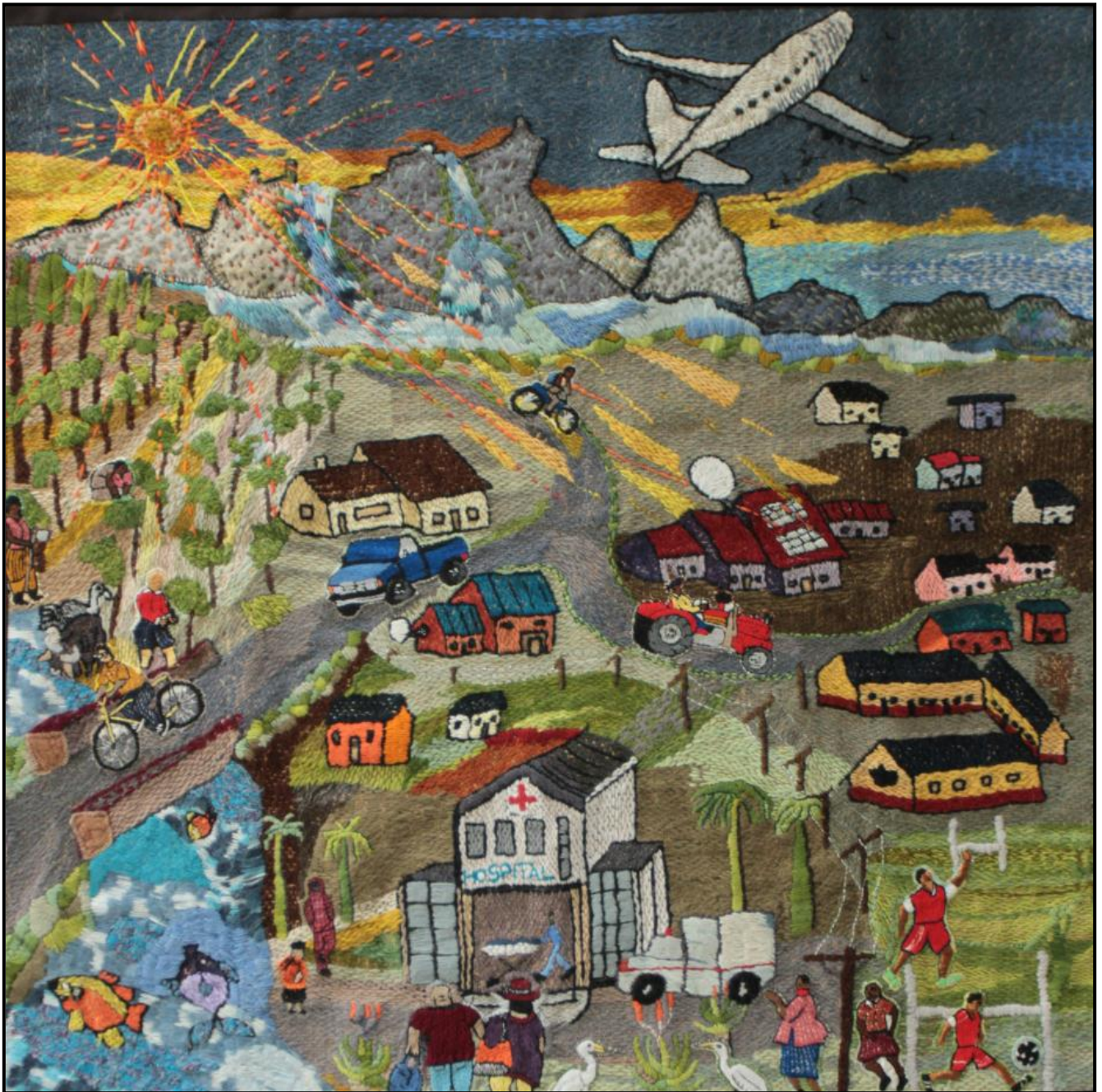
FIGURE 4: Siyabonga Maswana and Sanela Maxengana (Keiskamma Art Project), Our Vision for Africa , tapestry, 2020.