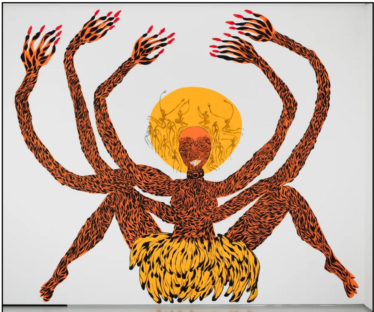
FIGURE 2b: Lady Skollie, Lust Politics , wall painting, 2017.