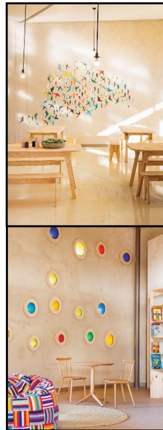
FIGURE 8c: Interior views of the school.