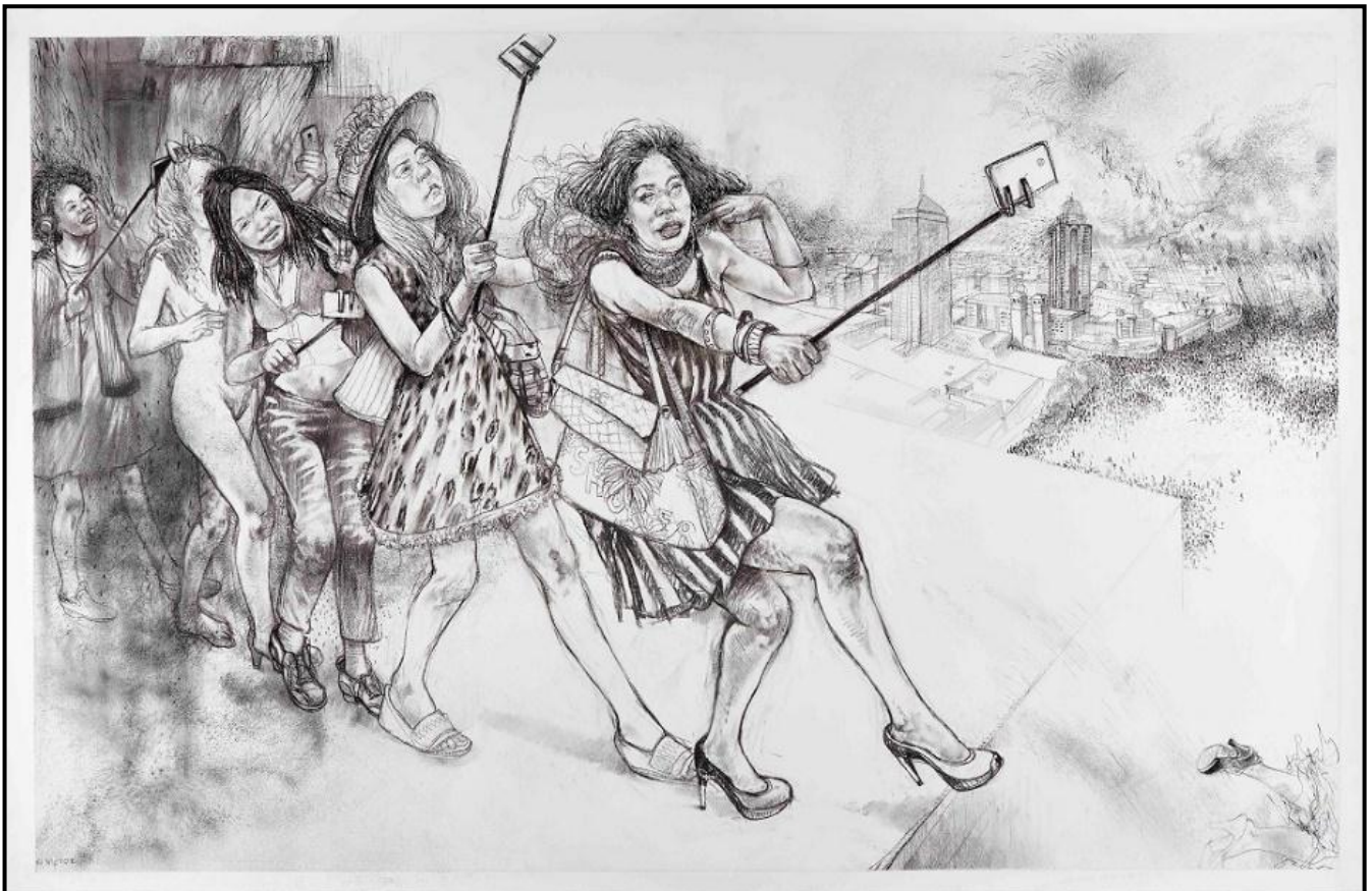
FIGURE 6b: Diane Victor, The Parable of the Selfie and the Self-perpetuating Problem , charcoal, pastel and ash on paper, 2015.