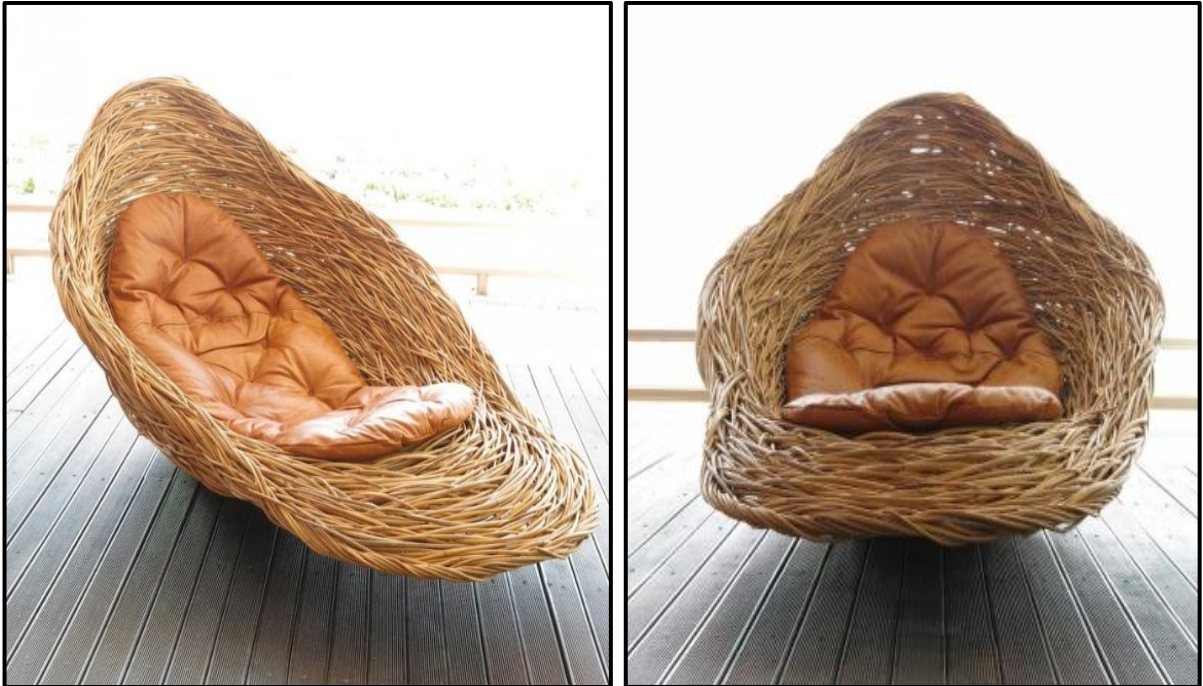
FIGURE L: Fallen Nest by Porcky Hefer (South Africa), 2019.

5.2.1 Do you think the product in FIGURE L above is considered a design or a craft, or both? Give reasons for your answer. (2)