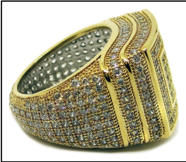
FIGURE E: Mega Chunky Men's Gold-plated Ring by Big Samy (USA), 2009.

3.1 Refer to FIGURE E and FIGURE F below and answer the question that follows.