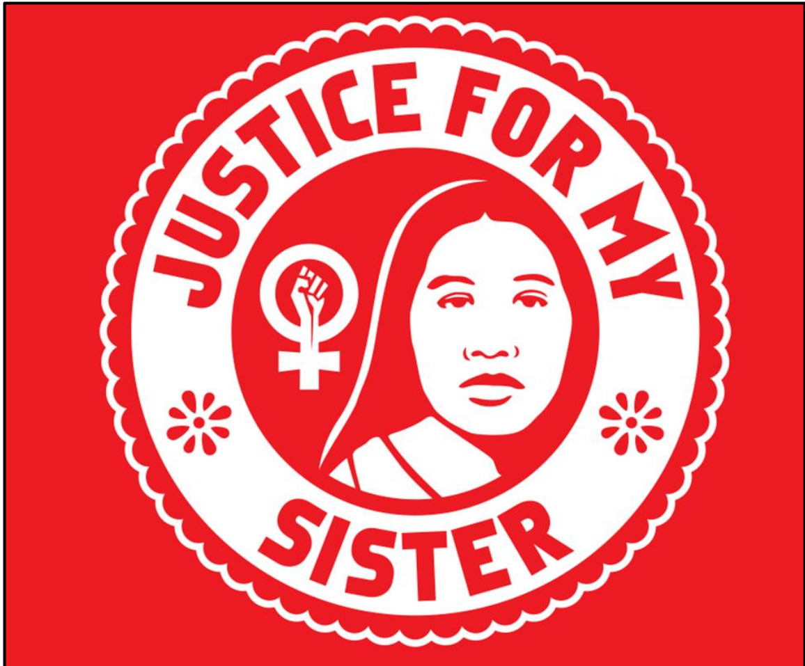
FIGURE C: Poster for Justice for my Sister Collective, designer unknown (USA), 2014.

Name THREE symbols evident in the design in FIGURE C above and discuss their possible meanings.