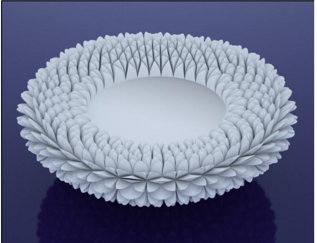
FIGURE B: Chrysanthemum Bowl by Michaela Janse van Vuuren (South Africa), 2009.

Layering and cutting of a type of nylon using a 3D printer.