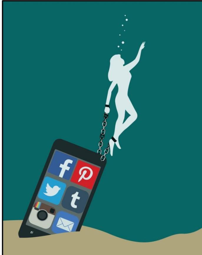
FIGURE K: Social Media Addiction Poster by CFAEU (Slovenia), 2018.

5.1.1 Discuss the message communicated by the poster in FIGURE K and explain how the designer has used imagery and layout to achieve this. (4)