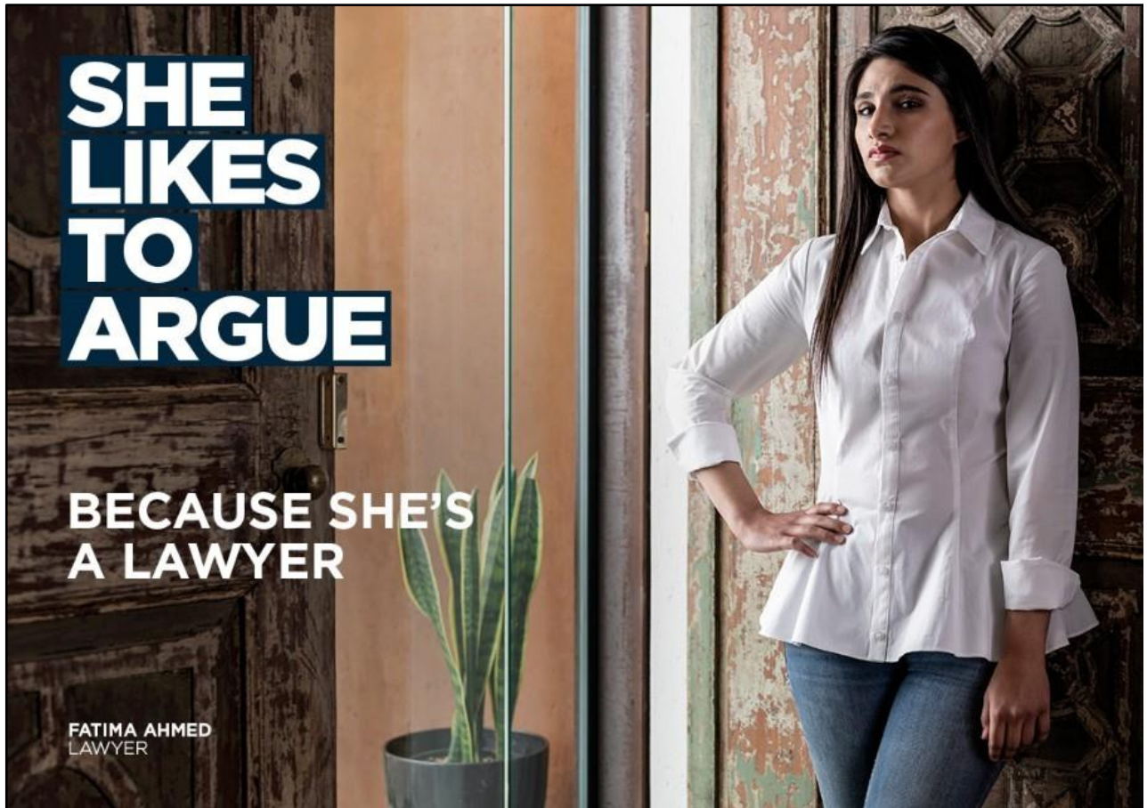
FIGURE D: PPS Women Acknowledged Campaign Poster, designer unknown (South Africa), 2018.

Discuss how the campaign poster in FIGURE D above uses wording and imagery to address the issue of stereotyping.