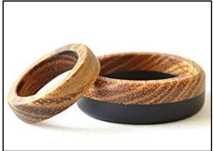
FIGURE F: Wooden Wedding Ring , designer unknown (South Africa), 2014.

Write an essay of at least 200–250 words (ONE page) in which you compare the ring in FIGURE E with the ring in FIGURE F.